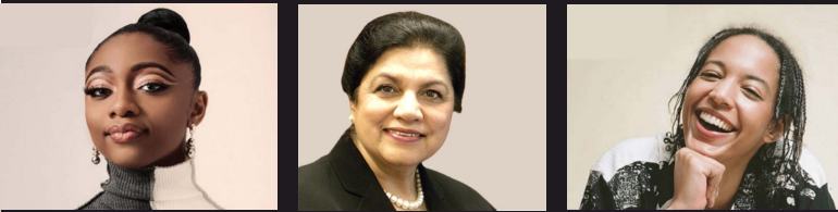
Samara Joy Multi-Grammy Jazz Vocalist